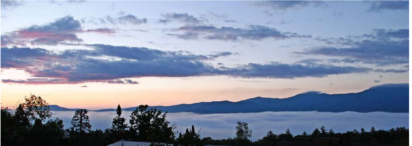
(Above the clouds at the Trapp Family Lodge)